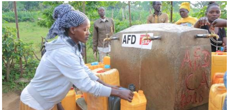
Water Provision by Christian Aid