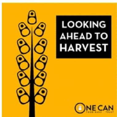
One Can Harvest Poster

More information at One Can Trust - Foodbank serving families in need