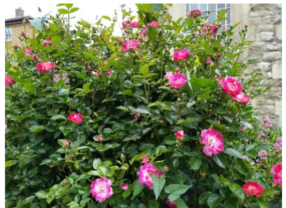
Trinity's rose in full bloom