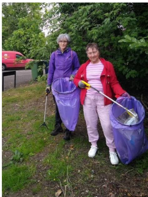
Two Anns from Cores End litter picking