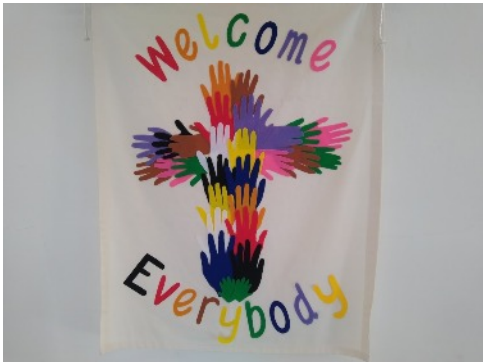
Welcome banner in Trinity Church