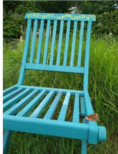
Butterfly on seat in the Meadow, Cores End