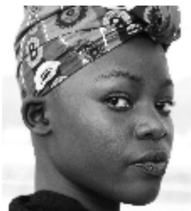
African woman in market

When a United Reformed group visited Nyamapanda in Zimbabwe in 2010 they were greatly impressed by the many income generating groups in the area. We shared stories of the welders, dressmakers, and electricians. The then Mayor had asked Silveira House to help the community find ways to earn a living. The skills learned and the training on HIV and reconciliation had a real effect on the growing township.