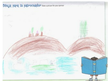
These pictures are of low quality and may not reproduce very well in this magazine. - Ed