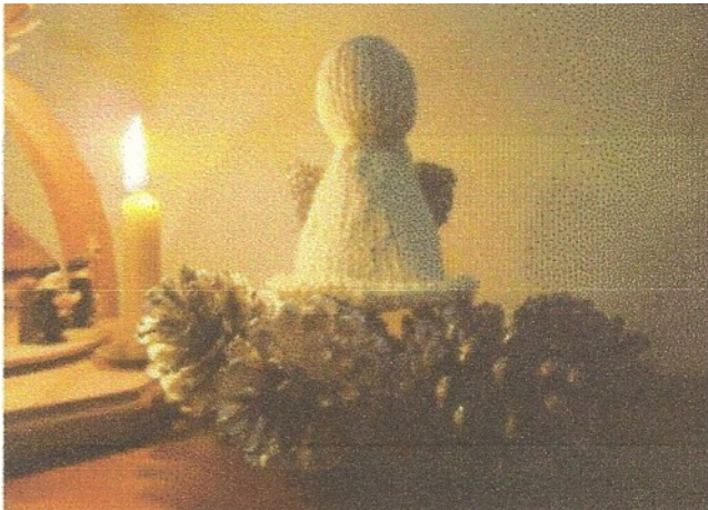
A completed angel

"Of course not, son. If you don't ask questions ... you'll never learn anything!"