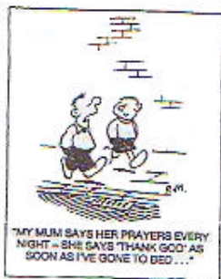
[From the parish magazine of Currie Kirk]