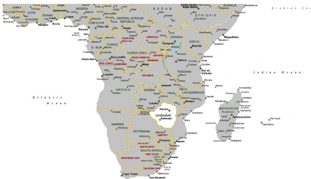
Where to find Zimbabwe in Africa

The project also monitored the progress of some of the activities which have been introduced. This included visits to 63 conservation farming plots, two peanut butter making processing machines, seven market gardens and 18 rain water harvesting tanks during the reporting period. None of the farmers were ready to pass on goats because they were delivered at a young age but all of the goats were found to be in good health.